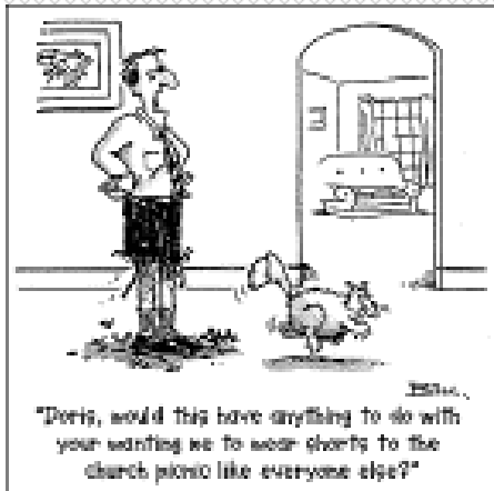
"Doris, would this have anything to do with your wanting me to wear shorts to the church picnic like everyone else?"